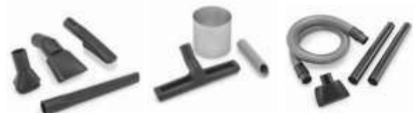
Car Set Wet Vacuuming Set Coarse Dirt Set