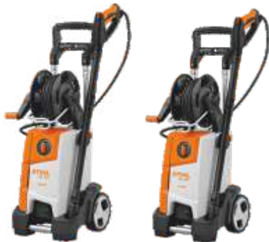
RE 130 Plus RE 140 Plus