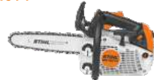
MS 194 T