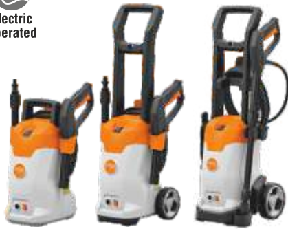
RE 80X RE 80 RE 90