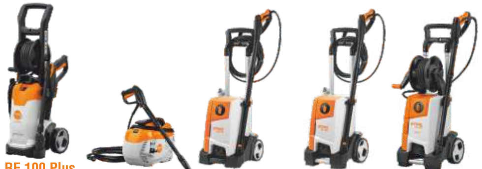
RE 100 Plus Control RE 105X RE 110 RE 120 RE 120 Plus