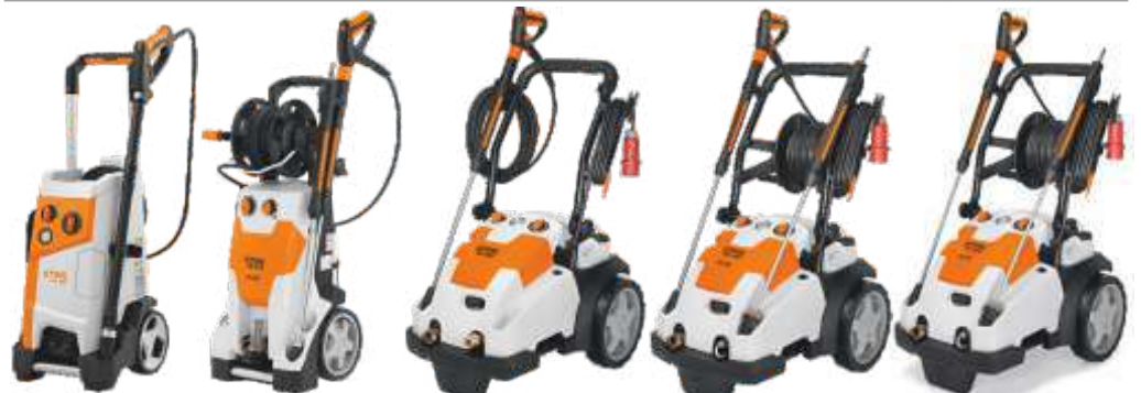
RE 150 RE 272 Plus RE 362 RE 362 Plus RE 462 Plus